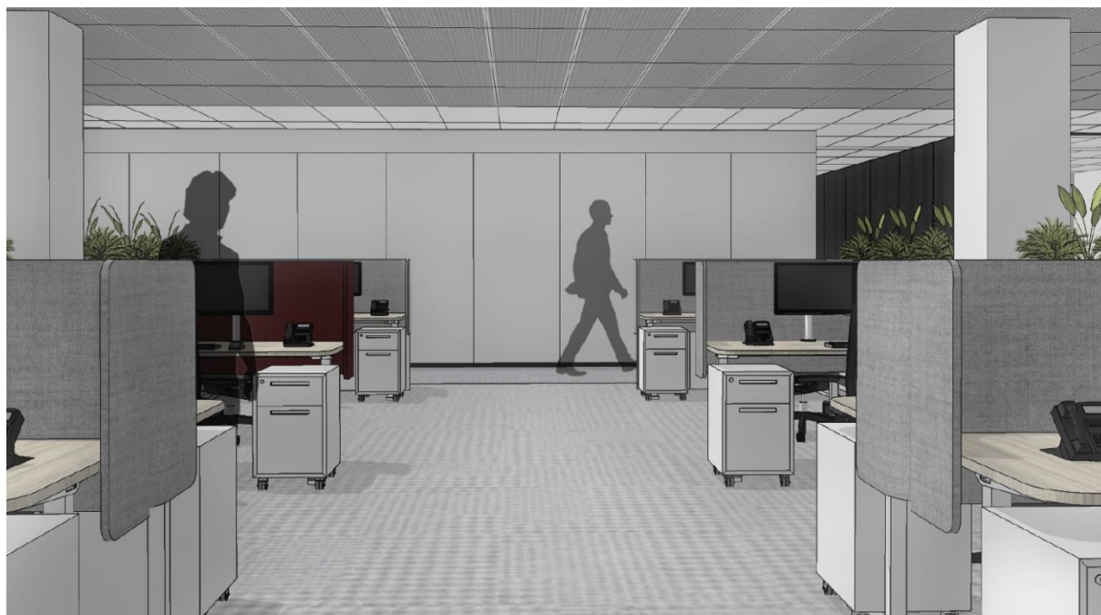
Architects render of the CSO's new fit-out

The project has been driven, in part, by the need for the CSO to comply with the NSW Government's accommodation and fit-out principles, under their clear direction to create consistent, efficient, flexible, agile and dynamic workplaces across the whole of Government.